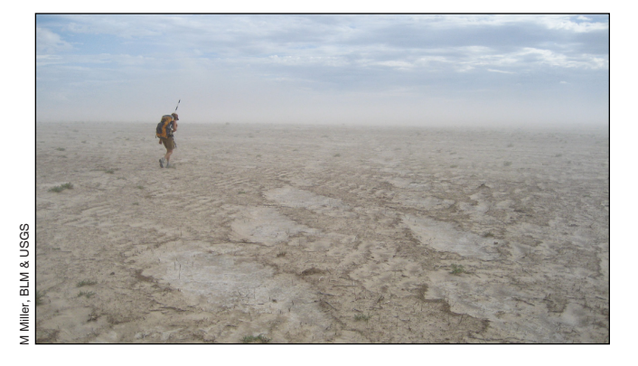
Figure 2. Drought-induced restoration failure could be minimized by anticipating future climate fluctuations at subseasonal to seasonal ("s2s") timescales. Dry conditions coupled with soil disturbance to reseed vegetation resulted in poor plant establishment and severe erosion in southwestern Utah (Miller et al. 2012; Duniway et al. 2015). Short-term s2s climate forecasts, now available through the US National Weather Service, can help managers avoid these undesirable outcomes and maximize the success of management activities, including restoration treatments.

Niño or La Niña conditions and associated teleconnections can help anticipate precipitation patterns months in advance, potentially providing opportunities for moving fire suppression or prevention resources between regions (Swetnam and Betancourt 1990).